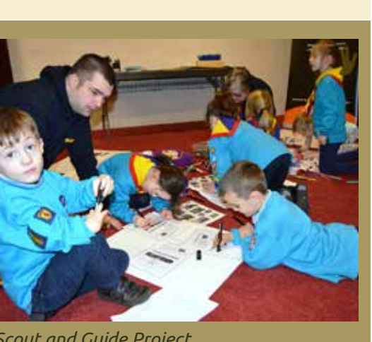
Scout and Guide Project