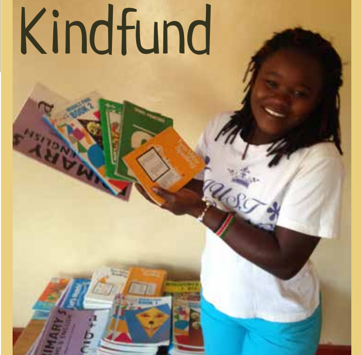
Principal with school books from N Ireland