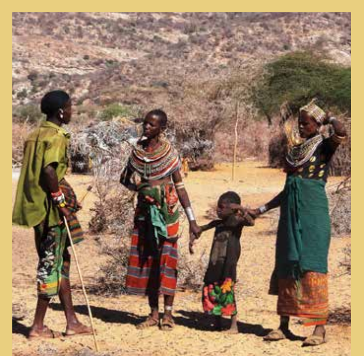
Mentally and Physically challenged child at Ndikir – potential for Honey Hill

We are praying for favor with the National Council for Persons with Disabilities that they will process the paperwork for the partial tuition coverage and that the funds will be found for the small balance to make this happen and soon.